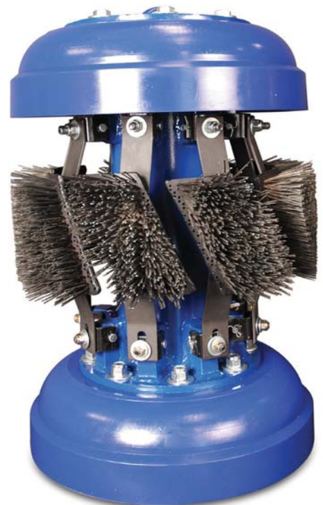
HZ DC Cup Pig

INTELLIGENT PIPELINE CLEANING corrosion control • dewatering • pit cleaning