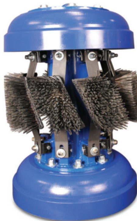
HZ DC Cup Pig

INTELLIGENT PIPELINE CLEANING corrosion control • dewatering • pit cleaning